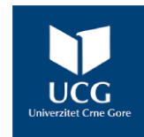
University of Montenegro